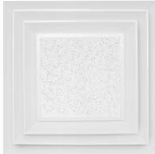
Model TML (2 Slot Shown)