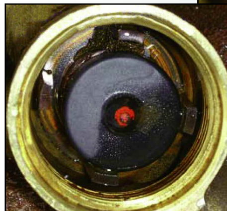
Mesurflo still works with many particles